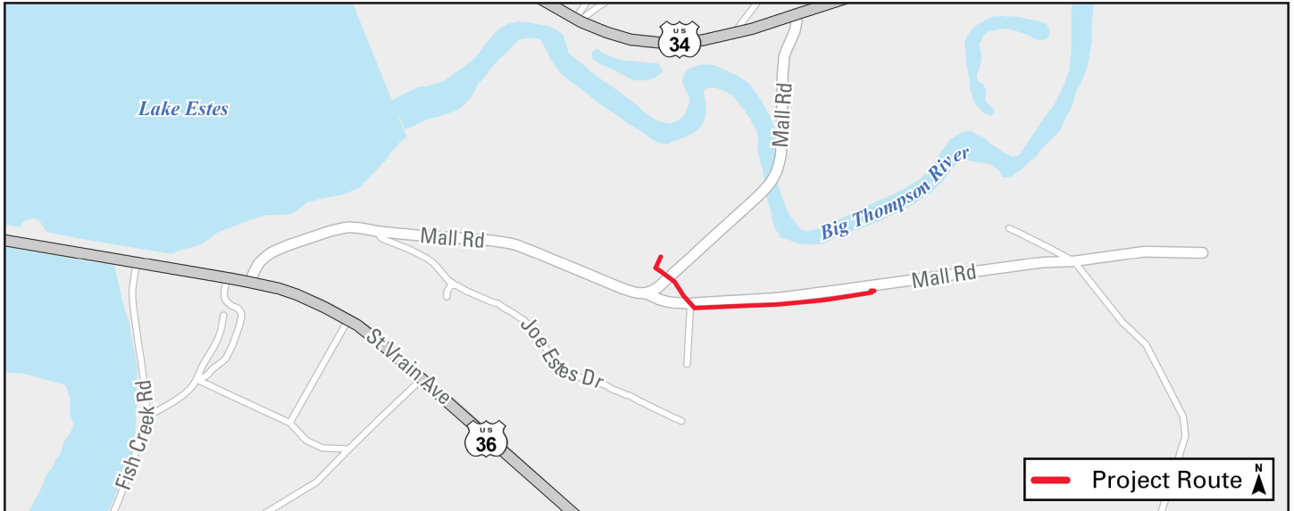
This map is a graphic and may not show exact locations.