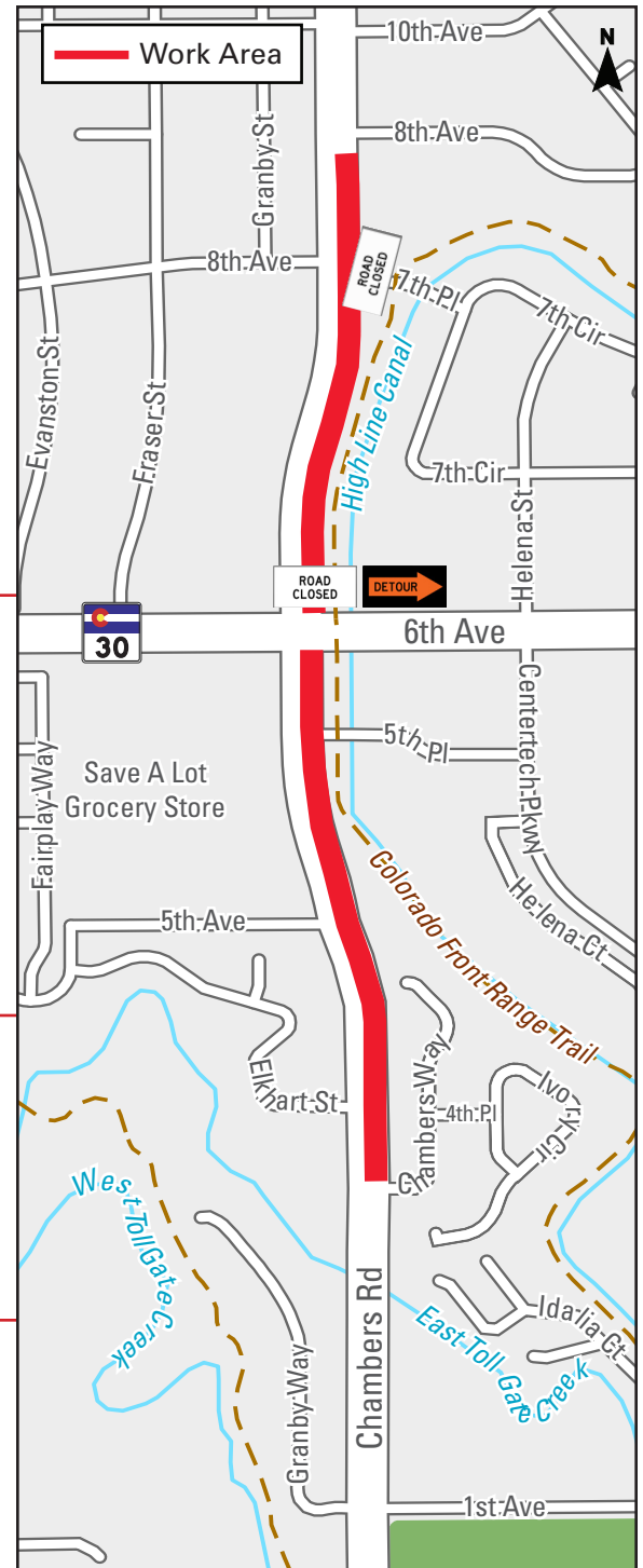
This map is a graphic and may not show exact locations.

If you suspect a natural gas leak, leave your home or business immediately. Once you are safely away, call 911 , then Xcel Energy at 800-895-2999 .