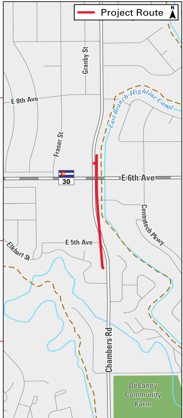
This map is a graphic and may not show exact locations.