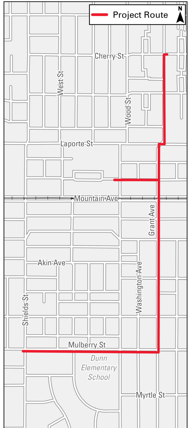
This map is a graphic and may not show exact locations.

If you suspect a natural gas leak, leave your home or business immediately. Once you are safely away, call 911 , then Xcel Energy at 800-895-2999 .